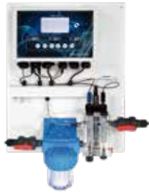
pH-Rx-Cl-F P control unit