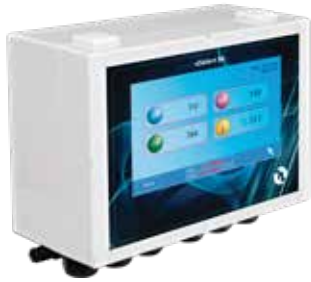
eSelect B4 series