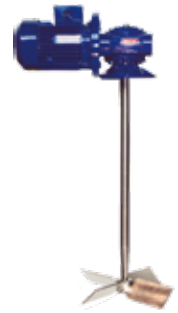
Electric acting mixer

From 1/2" to 8" demineralised water • Threaded: wet & dry dial • Flanged: dry dial Mixer • For vessel up to 1000 liters capacity • Shaft in PP, 316 Stainless Steel, from 600 to 1200mm • rom 0,08 kW to 0,18 kW; manual acting • Chemical holding tanks • Capacities up to 1000 liters, polyethylene, graduated scale • Working temperature from -40°C to +60°C • Non toxic - suitable for food industry • UV stabilized • Electromagnetic Flow Meters