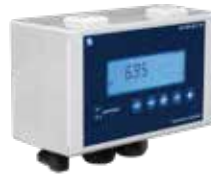
eSelect B1 series