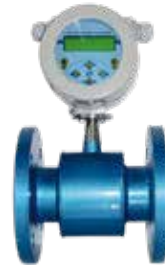
Electromagnetic flow meter