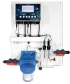
pH-Rx-F control unit