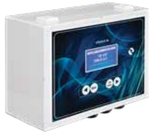
eSelect M series