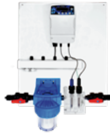
pH-Rx control unit