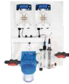
pH-Cl-F P control unit