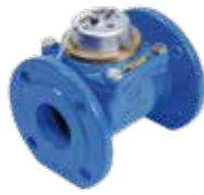
Flanged water meter