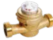
Threaded water meter